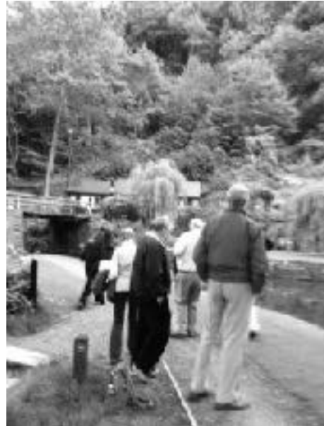
On the towpath