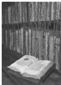
The Chained Library

We took a stroll around viewing the gilded and painted shrine of St Ethelbert, the colourful, restored Shrine of St Thomas of Hereford, medieval stained glass windows in the Lady chapel and four modern stained glass windows dedicated to the life and writings of the 17th century cleric and poet Thomas Traherne. There was time for some light refreshment in the Cloister cafe before we entered the Mappi Mundi exhibition. We enjoyed the interactive displays prior to viewing the extremely interesting map itself. On then to the Chained Library, where the learned guides shared their knowledge of the impressive room and its ancient volumes. We had time then, to make our way into the town centre for some further refreshment and shopping before heading back to the minibus.