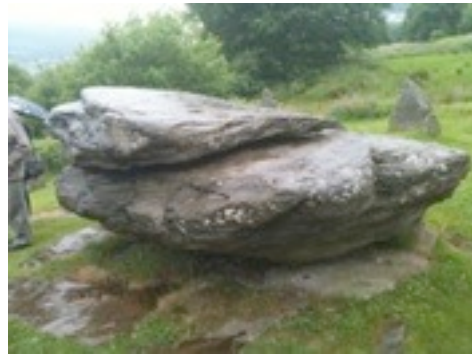
The Rocking Stone