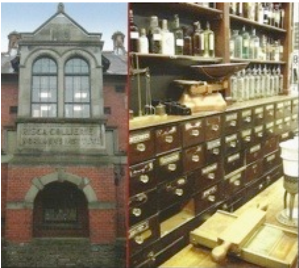
The museum at Risca with complete chemist's shop